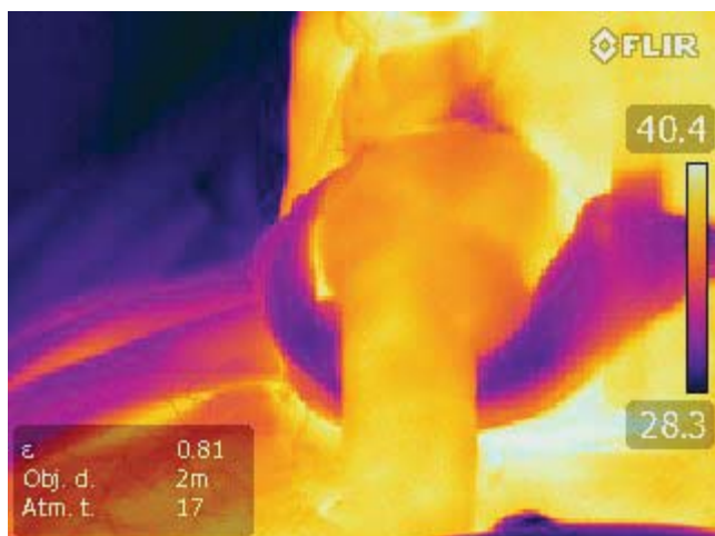
Figure 2. Good vascularization from the perforators (day 2 after surgery).

We decided to excise the tumoral mass and to reconstruct the defect using a paramedian forehead flap. The flap was evaluated using the infrared thermal camera which allowed us to detect the supratrochlear artery (Figure 3) and to design the narrow pedicle of the flap (Figure 4). We excised the tumoral mass with a 0.5 cm margins and we covered the defect of the medial canthus using a paramedian forehead flap from the opposite side. The flap was harvest superficial to the frontalis muscle in the distal part and next to the periosteum in the proximal part. The flap showed a good vascularization on the postoperatively evaluation with the termographic camera and no complication occurred.