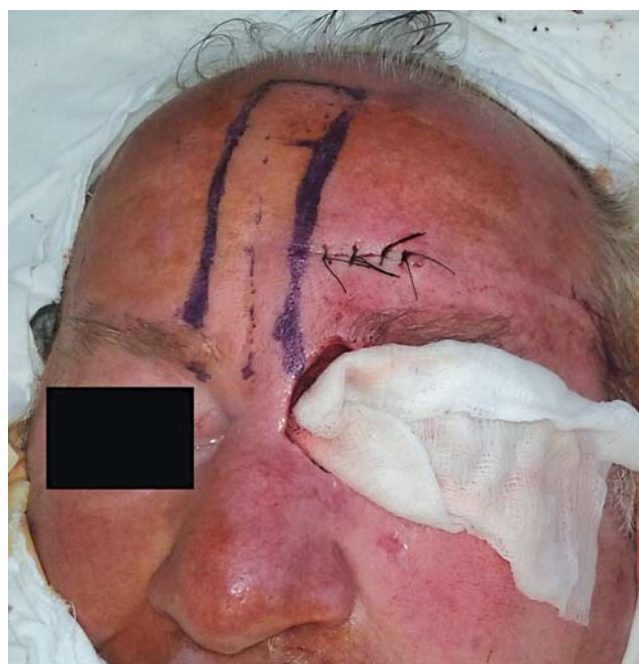
Figure 4. The design of the paramedian forehead flap pedicle.

ulcerated tumoral mass involving the medial canthus of the left eye and the glabella. Reconstruction using an opposite paramedian forehead flap was considered and evaluation of the local vascularization was performed using the thermal infrared camera. Despite expectations, the thermal camera showed no flow in the opposite supratrochlear artery that would determine a poor vascularization of the paramedian forehead flap with a higher rate of necrosis (Figure 5). So, we decided to reconstruct the defect using local advancement flaps from the cheek and forehead. Postoperative evaluation showed a good vascularization of the reconstructed area with no further complications.